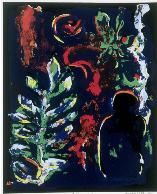
David C. Driskell, Silence , 2009, Screenprint, 15 x 12 in., Purchase, The Hereward Lester Cooke Memorial Fund, 2009; © Cardinal Point Press