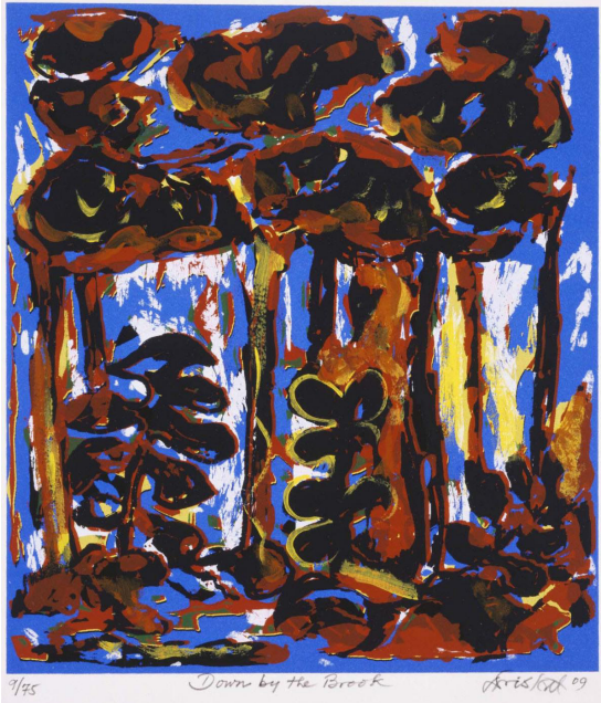
David C. Driskell, Down by the Brook , 2009, Screenprint, 15 x 12 in., Purchase, The Hereward Lester Cooke Memorial Fund, 2009; © Cardinal Point Press

DIRECTIONS: Look at each of the following paintings and look for similarities among the three paintings. Then, with your partner, answer the questions that follow.