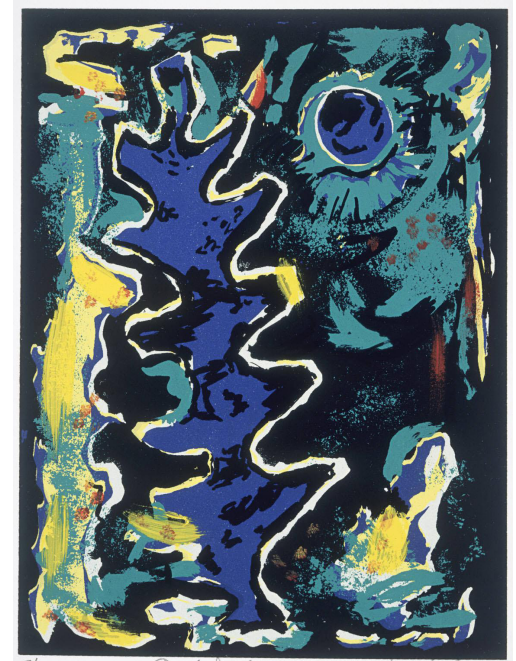
David C. Driskell, Pond Iced Over , 2009, Screenprint, 15 x 12 in., Purchase, The Hereward Lester Cooke Memorial Fund, 2009; © Cardinal Point Press