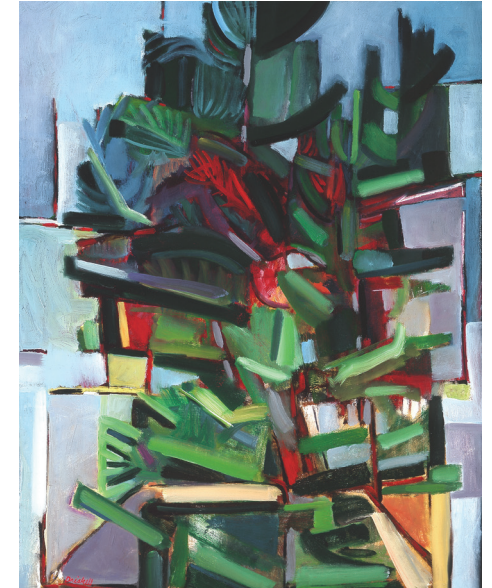
David C. Driskell, Two Pines #2 , 1964, Oil on canvas, 48 x 36 in.

Art Bridges, Bentonville, Arkansas, AB.2018.3. © Estate of David C. Driskell