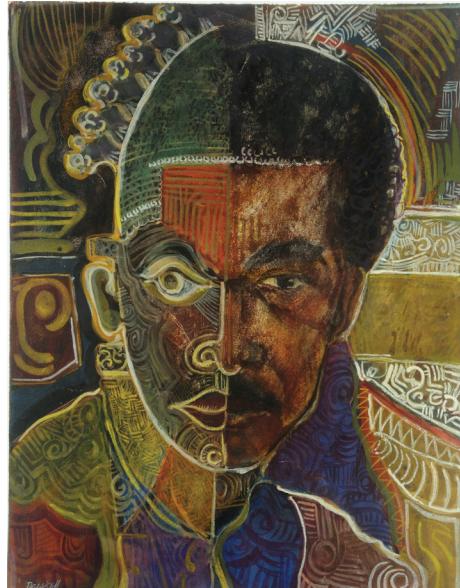
David C. Driskell, Self-Portrait as Beni ("I Dream Again of Benin") , July 13, 1974, Egg tempera, gouache, and collage, 17 x 13 in.

Tougaloo College Art Collections, Tougaloo, Mississippi. Purchased by Tougaloo College with support from the National Endowment for the Arts, 1973.084. © Estate of David C. Driskell