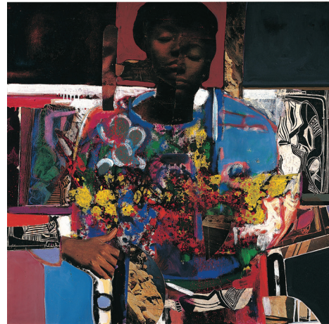
David C. Driskell, Woman with Flowers , 1972, Oil and collage on canvas, 37 1/2 x 38 1/2 in.

Art Bridges, Bentonville, Arkansas, AB.2018.3. © Estate of David C. Driskell