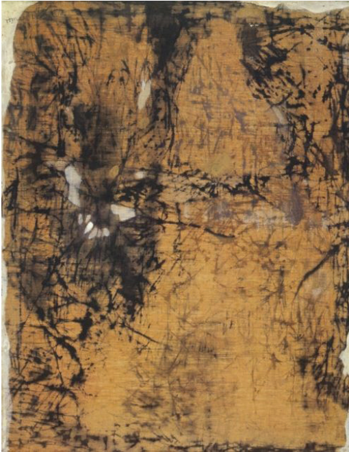
Romare Bearden, Old Poem , 1960, Oil on linen, Private collection

DIRECTIONS: Study each of the paintings. Then, answer the questions that follow.