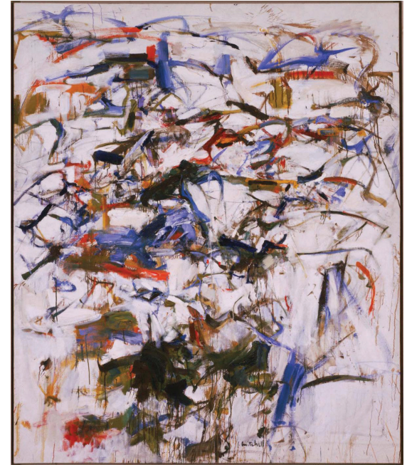
Joan Mitchell, August, Rue Daguerre, 1957, Oil on canvas, 82 x 69 in., Acquired 1958