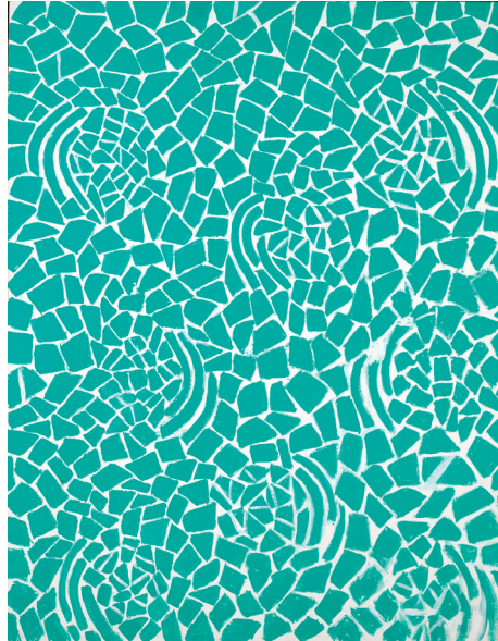
Alma Thomas, Grassy Melodic Chant , 1976, Acrylic on canvas, 46 x 36 in., Smithsonian American Art Museum