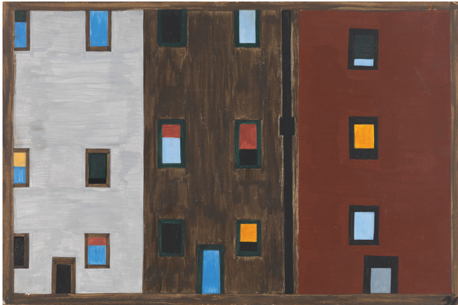
Jacob Lawrence, The Migration Series , Panel no. 31: The migrants found improved housing when they arrived north. , 1940-41

What shapes do you see in these Jacob Lawrence paintings? Circle the different shapes.