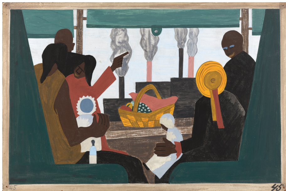
Jacob Lawrence, The Migration Series , Panel no. 45: The migrants arrived in Pittsburgh, one of the great industrial centers of the North. , 1940-41