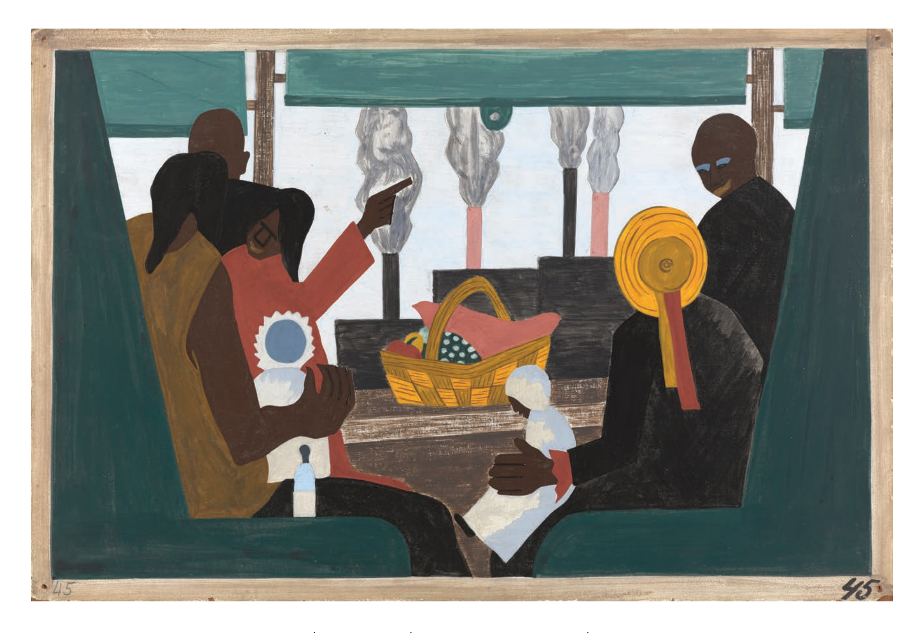
Jacob Lawrence, The Migration Series, Panel no. 45: The migrants arrived in Pittsburgh, one of the great industrial centers of the North.