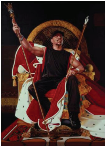
Kehinde Wiley, Ice-T , 2005

Oil on canvas, 96 x 72 in. Private collection, Courtesy of Rhona Hoffman Gallery © Kehinde Wiley