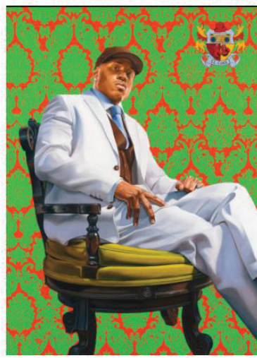
Kehinde Wiley, LL Cool J , 2005

Oil on canvas, 96 x 72 in. Private collection, Courtesy of Rhona Hoffman Gallery © Kehinde Wiley