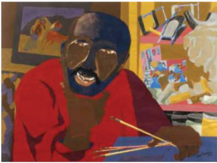
Jacob Lawrence, Self-Portrait , 1977

Gouache and tempera on paper, 23 x 31 in. National Academy of Design, New York