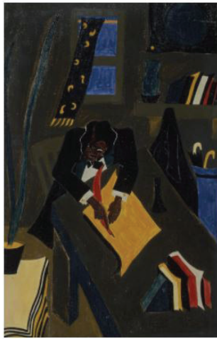
Jacob Lawrence, Frederick Douglass, Panel no. 21 , 1939

Gouache and tempera on paper, 23 x 31 in. National Academy of Design, New York