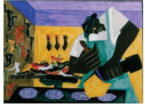
Jacob Lawrence, The Shoemaker , 1945

Casein tempera on hardboard, 17 7/8 x 12 in. Hampton University Museum, Virginia © 2015 Jacob and Gwendolyn Knight Lawrence Foundation, Seattle/ Artists Rights Society (ARS), New York